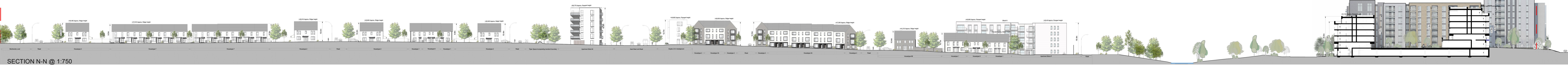
SECTION N-N @ 1/750