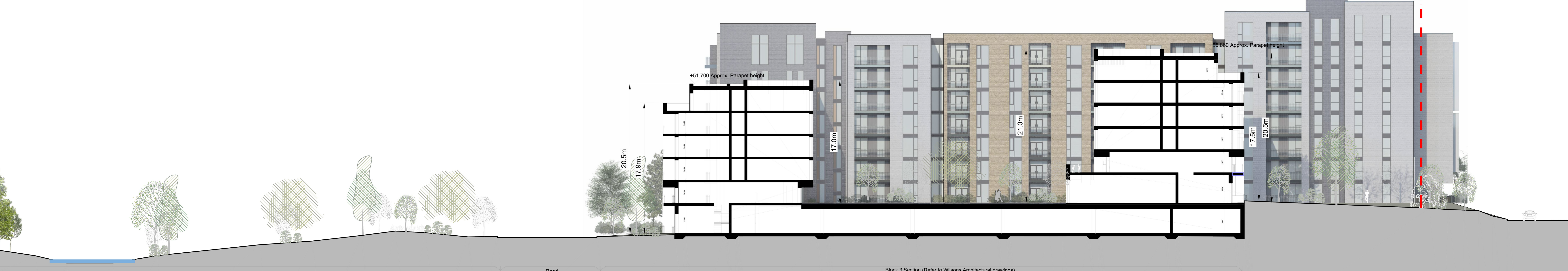
SECTION N-N Continued 4/4