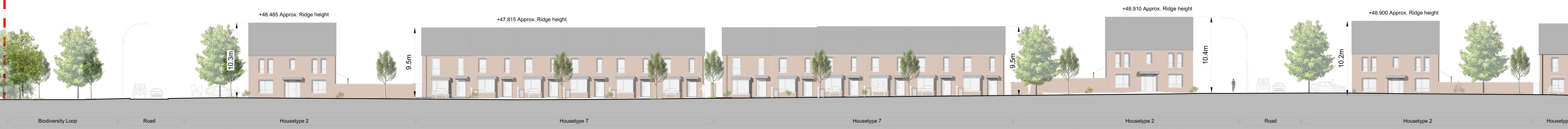
SECTION N-N 1/4