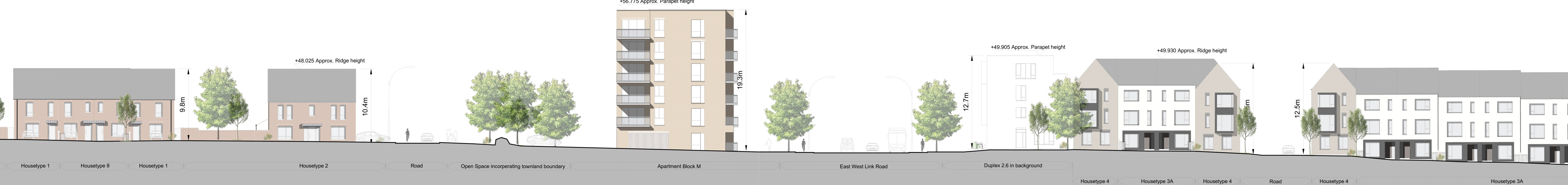
SECTION N-N Continued 2/4